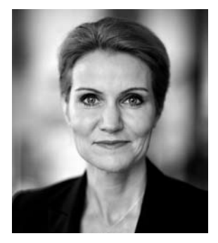
Helle Thorning-Schmidt Prime Minister, Denmark