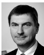
Andrus Ansip Prime Minister of Estonia