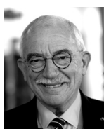
Uffe Ellemann-Jensen Chairman, Baltic Development Forum