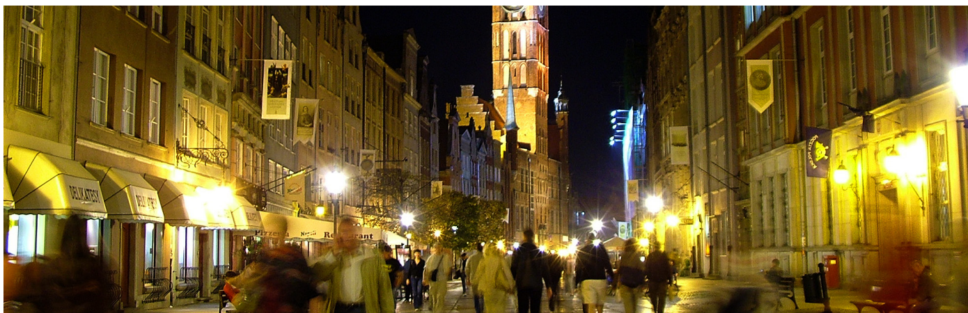
Długi Targ Street, Gdansk