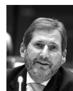
Johannes Hahn Commissioner for Regional Policy, European Commission