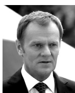
Donald Tusk Prime Minister of Poland