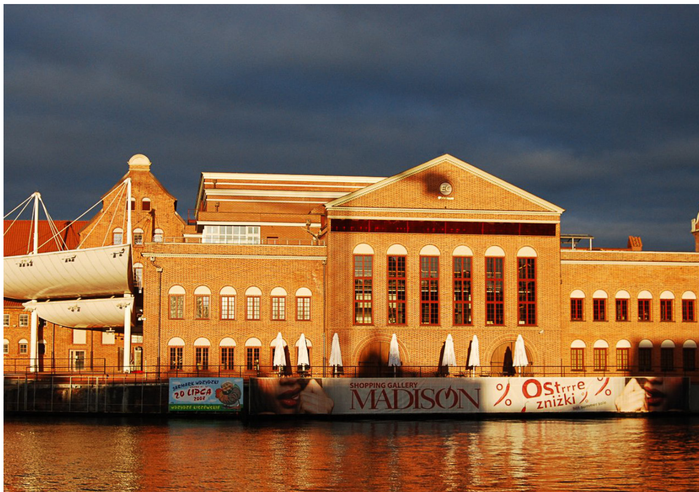
The Polish Baltic Frédéric Chopin Philharmonic, Gdansk