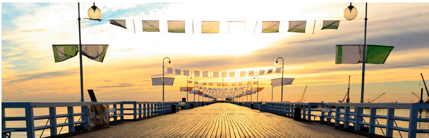
The Sopot Pier