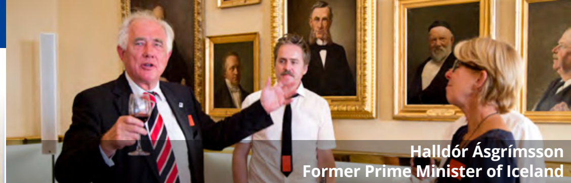
Halldór Ásgrímsson Former Prime Minister of Iceland

The evening culminated in a tour of the Tower of Christianborg, the tallest of Copenhagen's many towers, providing a breathtaking view of the city (and conveniently located within the Danish parliament!), before speakers and participants retired contentedly for the evening in preparation for the following day's activities.