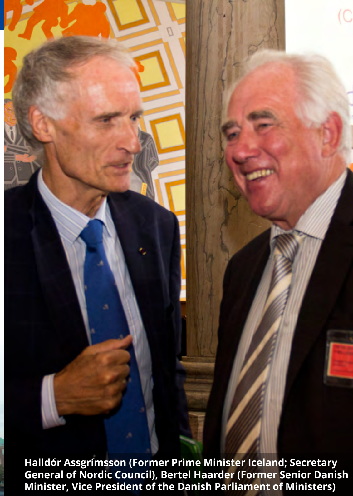
Halldór Assgrímsson (Former Prime Minister Iceland; Secretary General of Nordic Council), Bertel Haarder (Former Senior Danish Minister, Vice President of the Danish Parliament of Ministers)