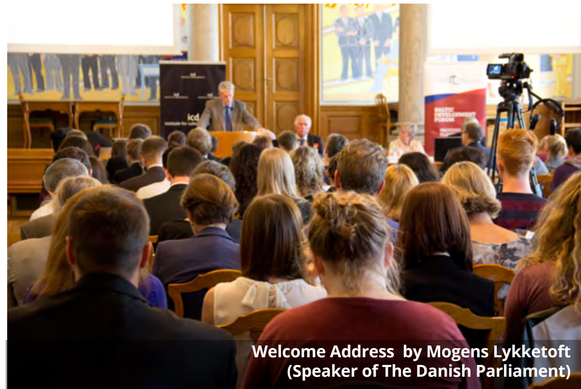
Welcome Address by Mogens Lykketoft (Speaker of The Danish Parliament)

In a wider context, arts, culture and creativity can play an active role in the economy, job market and international relations. However, "the value of art and culture is easily lost if we only expect specific results or outcomes from it." Reflecting this, a memorandum of understanding between Denmark and China has been signed, which will herald a range of art exhibition and professional exchanges. The content of this is left entirely to the artists and professionals themselves, and therefore will maintain high quality and relevance in terms of cultural diplomacy.