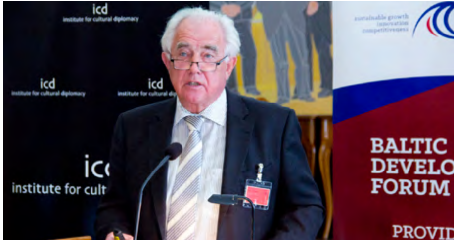
Halldór Ásgrímsson, Former Prime Minister of Iceland; Former Secretary General for the Nordic Council of Ministers.

"Cool North: Cultural Diplomacy in the Nordic Countries" would not have been possible without the economic support and cooperation of the Nordic Council of Ministers, the official inter-governmental body for cooperation in the Nordic region.