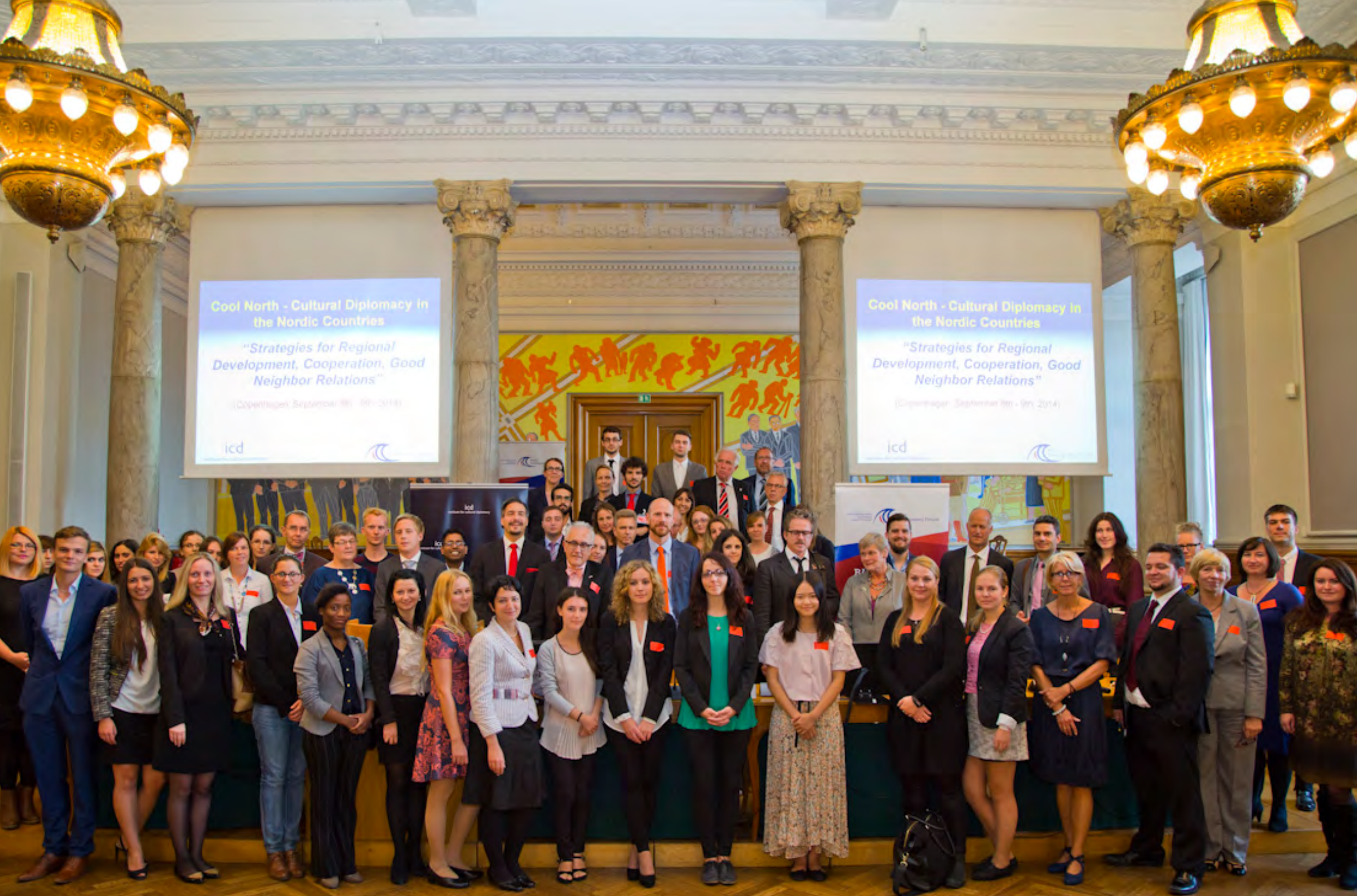
Speakers & Delegates at Christiansborg Palace, The Parliament of Denmark Cool North - Cultural Diplomacy in the Nordic Countries