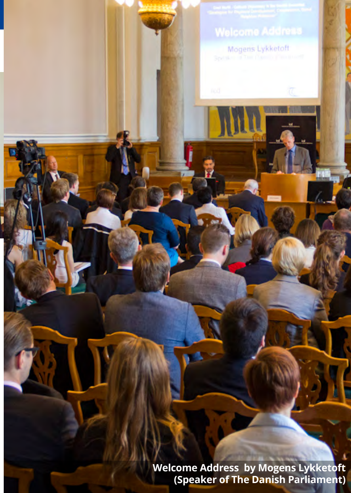
Welcome Address by Mogens Lykketoft (Speaker of The Danish Parliament)

The Conference presented these achievements to the international community, giving them an insight into the Nordic countries and the successful strategies they use. The conference took place in Copenhagen and brought together experts from the fields of international relations, diplomacy, politics, economics and the cultural and educational sectors. Specific case studies of Scandinavian Cultural Diplomacy were reviewed, with particular emphasis on the ability of successful practices of Cultural Diplomacy to improve international relations. The conference also examined whether the example set by the Nordic countries can be utilized further in regional and international cooperation in the future.