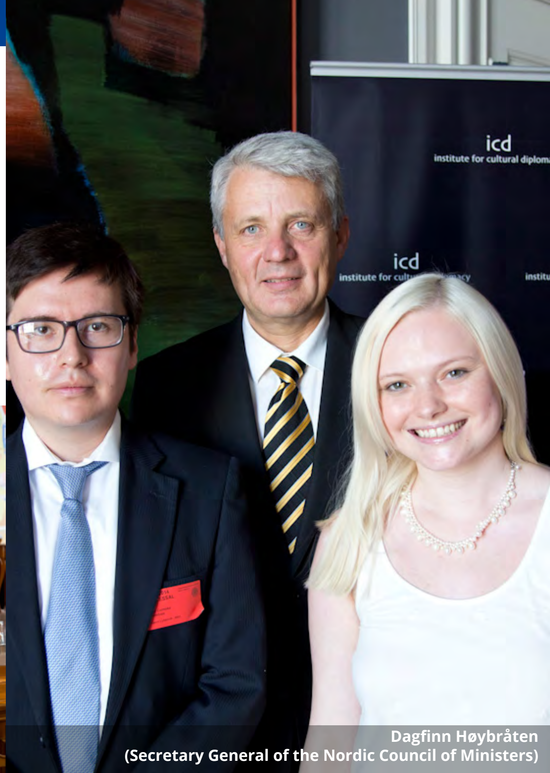
Dagfinn Høybråten (Secretary General of the Nordic Council of Ministers)