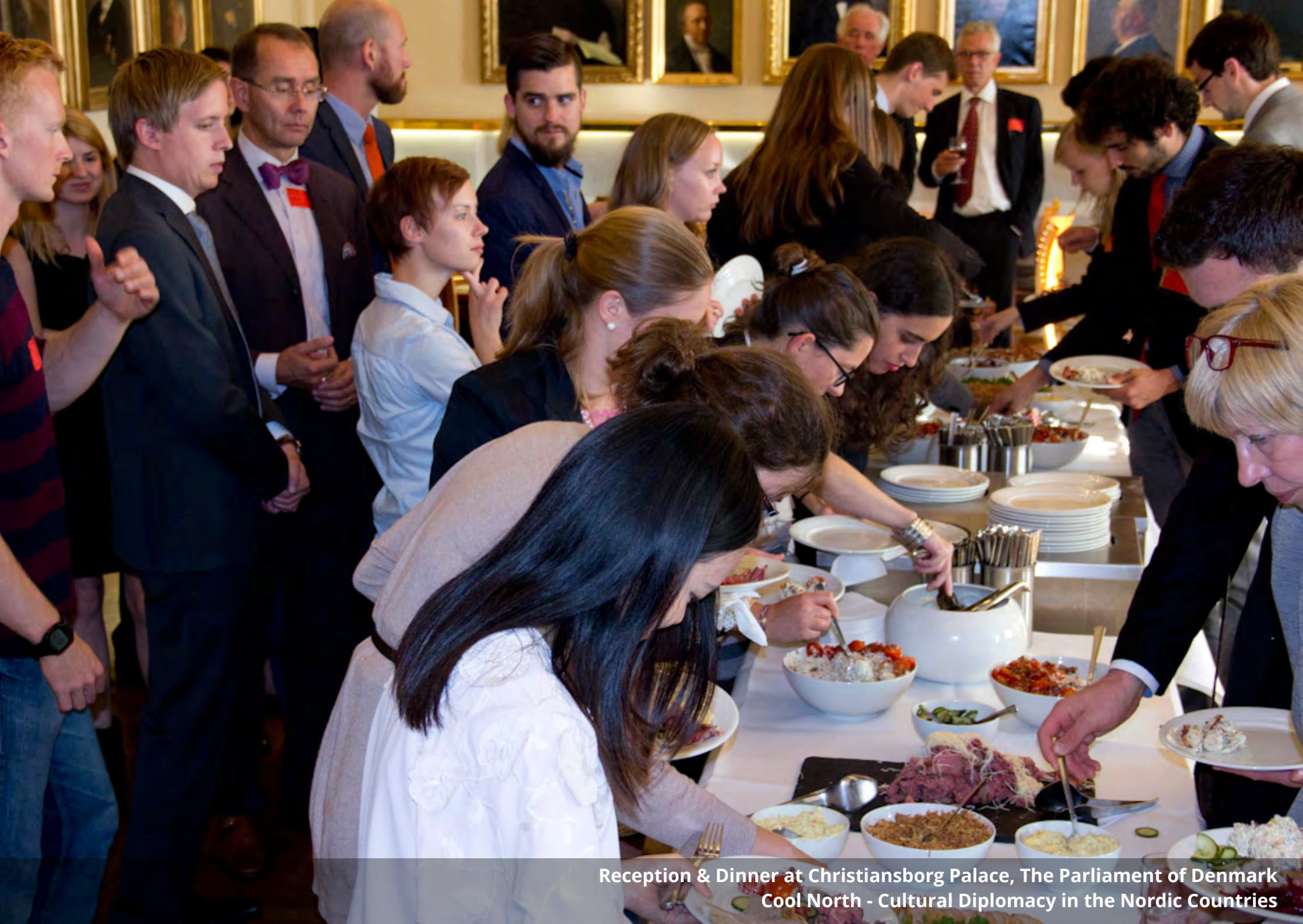
Reception & Dinner at Christiansborg Palace, The Parliament of Denmark Cool North - Cultural Diplomacy in the Nordic Countries