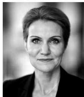
Helle Thorning-Schmidt Prime Minister, Denmark