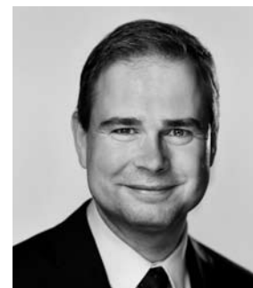
Nicolai Wammen Minister for European Affairs, Denmark