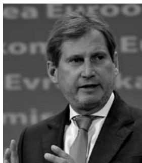
Johannes Hahn Commissioner for Regional Policy, European Commission