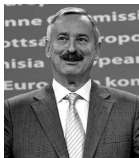
Siim Kallas Vice President, European Commission