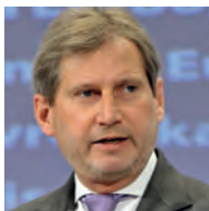
Johannes Hahn, Commissioner for Regional Policy, European Commission

From around 60 high level speakers you will have the pleasure of listening to Helle Thorning-Schmidt, Danish Prime Minister, Johannes Hahn, EU Commissioner for Regional Policy, and Nicolai Wammen, Danish Minister of European Affairs, who is inviting his colleagues from around Europe and Russia including the Russian Deputy Minister of Foreign Affairs.