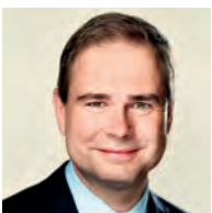
Nicolai Wammen, Minister for European Affairs, Denmark

From around 60 high level speakers you will have the pleasure of listening to Helle Thorning-Schmidt, Danish Prime Minister, Johannes Hahn, EU Commissioner for Regional Policy, and Nicolai Wammen, Danish Minister of European Affairs, who is inviting his colleagues from around Europe and Russia including the Russian Deputy Minister of Foreign Affairs.