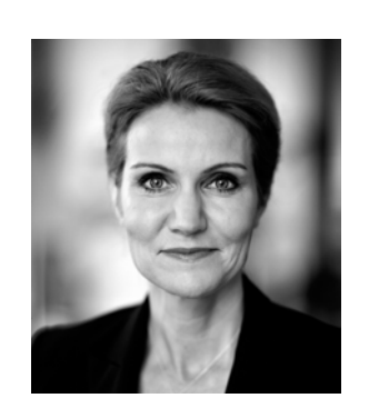
Helle Thorning-Schmidt Prime Minister, Denmark