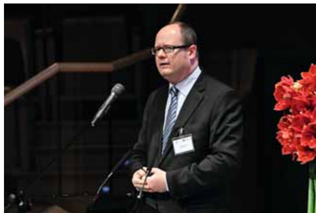
Welcome address by Paweł Adamowicz, Mayor of Gdańsk

establish a Polish think-tank on Baltic Sea Region affairs and strengthening relations with Nordic Council of Ministers.