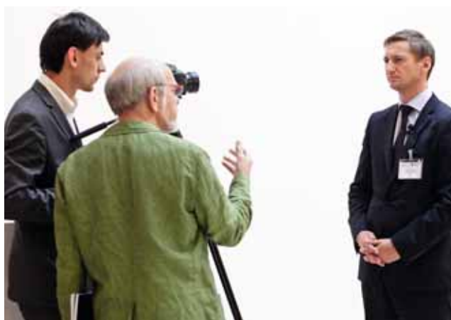
Westpomeranian Marshal being interviewed