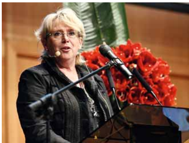
Lena Ek, Minister for the Environment, Sweden

“It’s thus to our advantage that two Baltic Sea countries, Poland and Denmark, preside the EU during our CBSS Presidency”, he said. “Together with the Commission we will try to inject new impetus into the co-operation between the CBSS and the EU”.