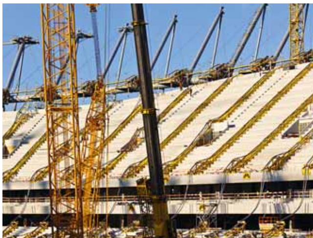
The National Stadium, Warsaw, during its construction. It was finished in November 2011 for the UEFA Euro 2012 hosted jointly by Poland and Ukraine.