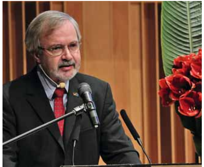
Werner Hoyer, Minister of State at the Federal Foreign Office, Germany