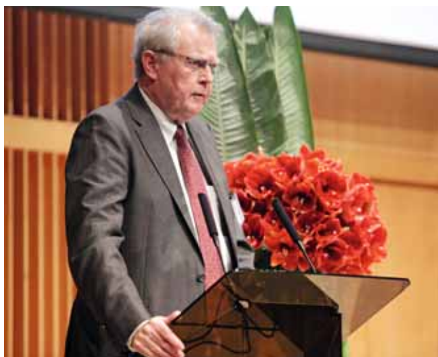
BDF Founder and Chairman Uffe Ellemann-Jensen receiving a warm and long applause for his important role in the development of the Baltic Sea Region.