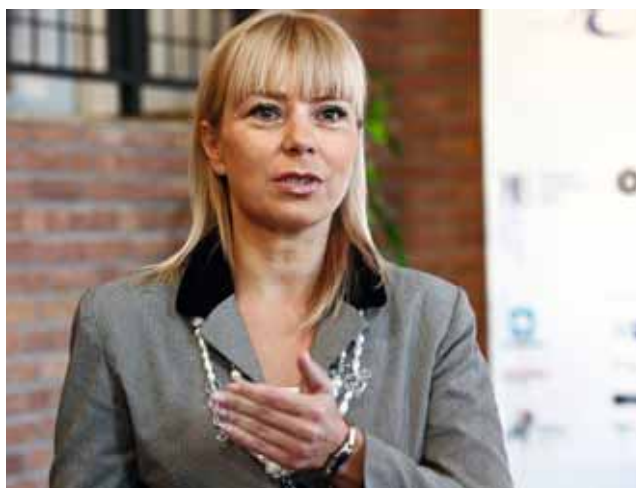
Elżbieta Bieńkowska, Minister of Regional Development, Poland

Poland's Minister of Regional Development Mrs. Elżbieta Bieńkowska emphasised that "In this difficult time, we need inspiration and good examples to follow. In this respect the Baltic Sea Region and the EUSBSR have plenty to offer to the European Union as a whole". She continued: "Its potential is exemplified by the ability to cope with the effects of the global economic crisis. There exist real possibilities for boosting competition, innovation, environmental protection, as well as further developing infrastructure and communication routes".