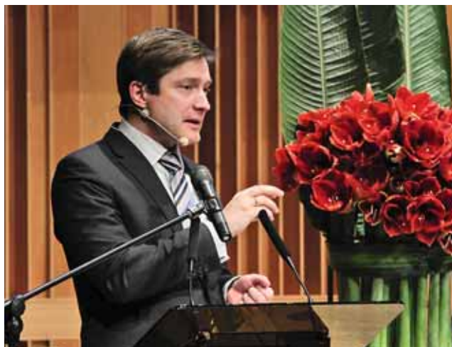
Rimantas Žylius, Minister of Economy, Lithuania

proach should be safeguarded in the EU multi-annual financial framework and through setting clear and measurable indicators and targets. The Minister also saw the need to further improve co-operation with Russia.