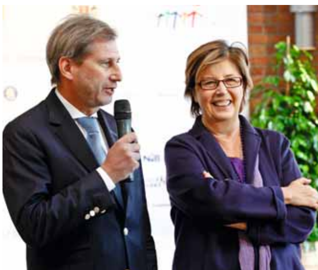
Time to meet the Press: Johannes Hahn, Commissioner for Regional Policy, and Mercedes Bresso, President, Committee of the Regions

Ministers has an extensive network in the Baltic Sea Region and a strong commitment to contribute to the implementation of the EU Strategy for the Baltic Sea Region.