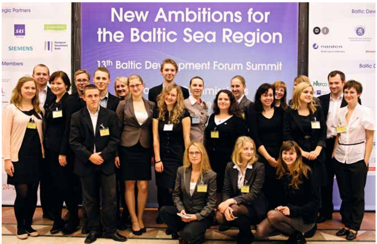
Volunteers from the University of Gdańsk

Also present in Gdańsk were approximately 30 students from the University of Gdańsk who were studying Scandinavian languages or regional studies. Their participation and help was widely appreciated.