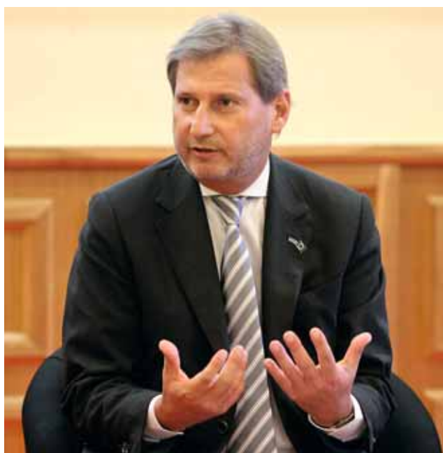
Commissioner Johannes Hahn at the internal EUSBSR meeting

Commissioner Hahn reflected upon some challenges of the EU Strategy, i.e. greater political commitment, agreement on roles and responsibilities of main stakeholders to better address administrative needs and alignment of funding and contribution of mainstream programmes into the Strategy. A key ambition was to further strengthen the role of key stakeholders and to encourage them to become more ambitious in implementing the Strategy as well as to develop a better understanding of the expectations that arise from undertaking Strategy responsibilities.