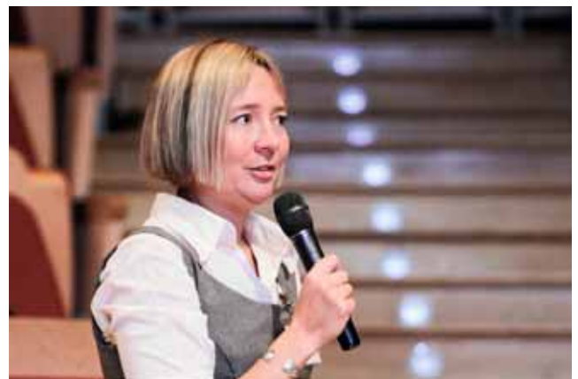
Question from the floor

Effective alignment of funding remains one of the crucial points for the further success of the Strategy. Stakeholders consequently underlined the need for comprehensive dialogue between National Contact Points and authorities responsible for cohesion policy in Member States involved about the Multiannual Financial Framework 2014-2020, mainly when it comes to future financing of macro-regional strategies.