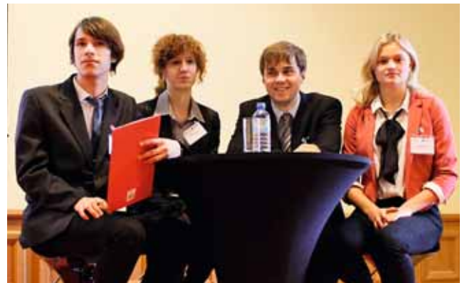
Students of the MEP Program

The MEP program also gives the participants the opportunity to experience the diversity of the countries around the Baltic Sea and be part of numerous social events, such as teambuilding, sightseeing along with living with a family in the host country. The sessions take place twice a year in the